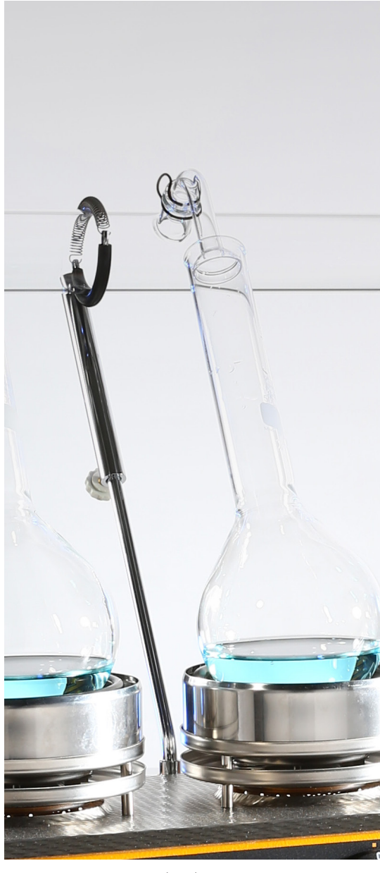
Issue 01/2023 | Subject to technical amendments