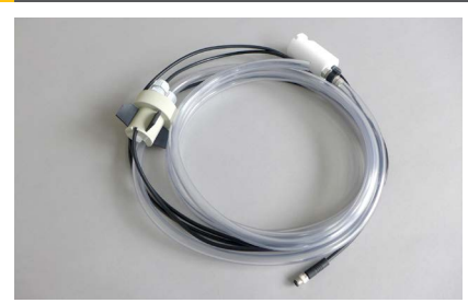
Tank level control 1005098